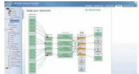
View a complete storage map from the virtual machine back to the hard drive