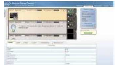
Easily virtualize compute modules and create virtual machines with Intel Modular Server Virtualization Manager