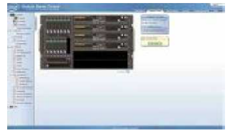
The Virtual Presence Modular Server Control allows you to see the components you physically have loaded in your system—even if they are powered down