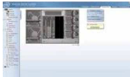
The back view of the chassis allows you to see the status of your modules and power supplies