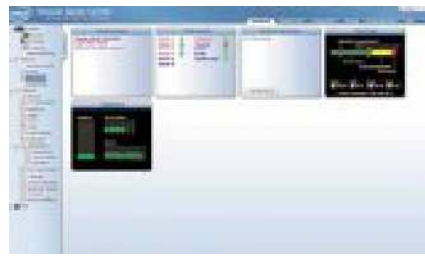
The Dashboard gives an overall system status view within the Modular Server Control