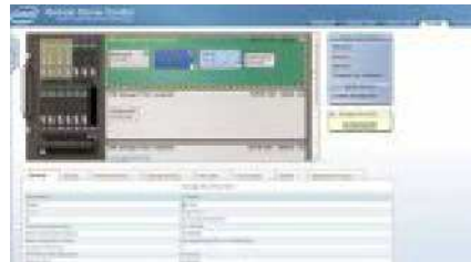
Create storage pools (either non-virtualized or virtualized) and virtual drives, and map virtual drives to multiple servers using the Intel Modular Server Virtualization Manager and Intel Shared LUN features